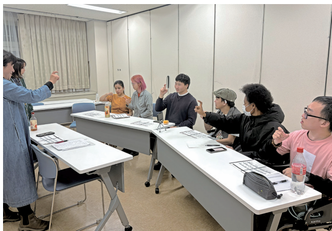
Cross Disability Learning on Japanese Sign Language

Training takes place at a variety of locations across Japan, including service providers for persons with disabilities, educational institutions and organizations of/for persons with disabilities.