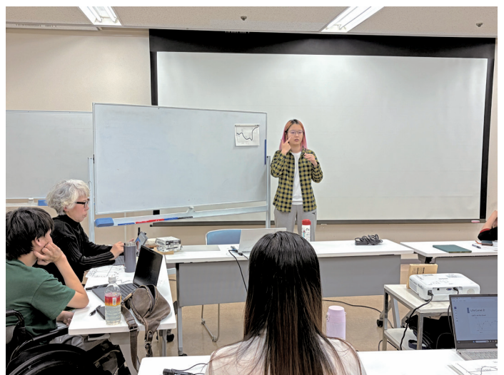
Group Training: L-Curve Workshop

Approximately 10 months (starting in October 2027 and ending in July 2028) ※The schedule is subject to change.